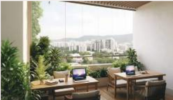
WORK FROM HOME AREA